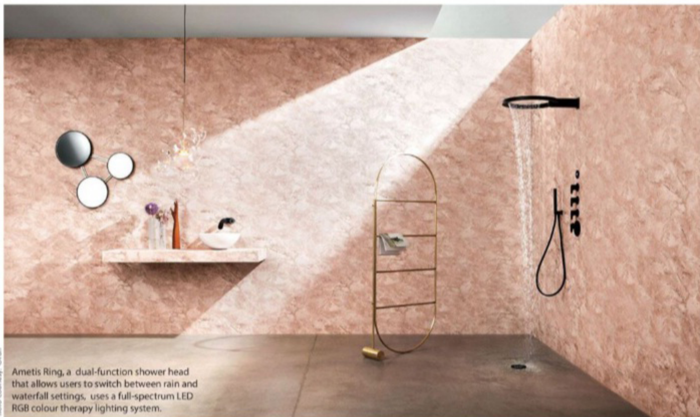
Ametis Ring, a dual-function shower head that allows users to switch between rain and waterfall settings, uses a full-spectrum LED RGB colour therapy lighting system.