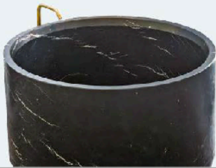
→ IN-OUT BY AGAPE A new edition of Benedini Associati's upright soaker, 1.3 metres in diameter, comes in a range of marble finishes, including Nero Marquina (shown). agapedesign.it