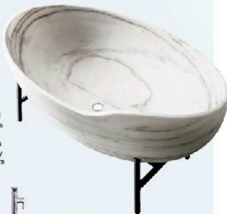
→ KORABY KREOO This elliptical tub, made of Italian marble, is 1.7 metres long and 64 centimetres deep. Its luxurious mass is juxtaposed against an airy iron tripod base. kreoo.com

Room-defining tubs that invigorate the bath experience