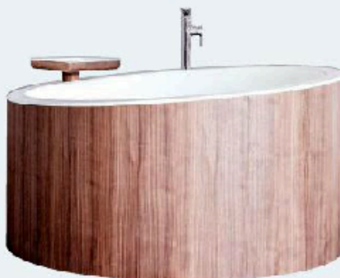
← DRESSAGE BY GRAFF This freestanding tub, from Studio Lombardo Nespoli and Novara, has a Corian interior and an exterior of solid canaletto walnut. The diagonal silhouette makes it easy to enter from one edge and lean back against the other. graff-faucets.com