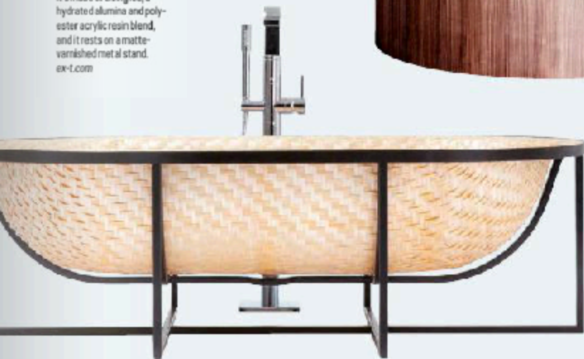
← OTAKU BY TAL ENGEL Israeli designer Tal Engel was inspired by traditional Asian boat building for this concept tub. A sheet of woven wood veneer is steamed into the curvaceous form, and it's coated with a polymeric material for strength. The piece was shown at IMM Cologne in January. talengel.com