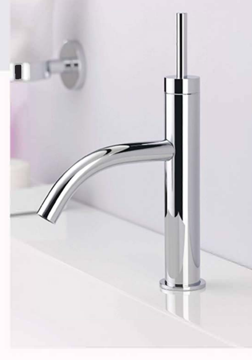
THG Paris introduces the Nano Collection of bath faucets. Featuring a contemporary, sleek design, the Nano faucet is available with a choice of petite cross handles or lever handles. Nano is available in several finishes including Rhodium Silver, Nickel and Gold. Circle No. 174 on Product Card

making the entire bath environment just a little more inviting and relaxation-inducing."