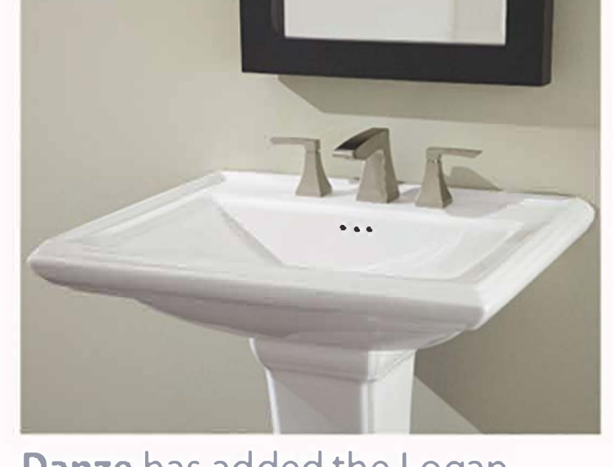
Square Collection to its line of bath faucets. The sculpted set of lav faucets features a range of style choices, including single-handle, two-handle centerset, widespread and several shower options. All are available in Chrome and Brushed Nickel finishes. The faucets are WaterSense approved for water savings. Circle No. 173 on Product Card

copper sinks, especially in our Brushed Nickel finish."