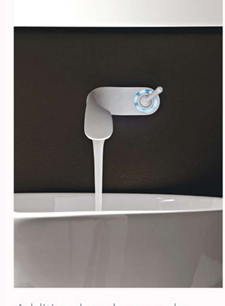
Additions have been made to Graff's Ametis Collection of bath faucets, including a single-lever vessel lavatory faucet, widespread lavatory faucet, wall-mounted LED lavatory faucet (shown) and bidet faucet. In addition to Chrome, the collection is now available in a Black or White finish, with a matte texture and appearance resulting from the company's state-of-theart powder coating process. Circle No. 175 on Product Card

Toto's Keane Faucet Collection melds modern fluidity with classic design elements for an elegant faucet suite that complements traditional, transitional and contemporary bath decors, according to the company. The faucet collection is available in either a widespread or singlelever option.