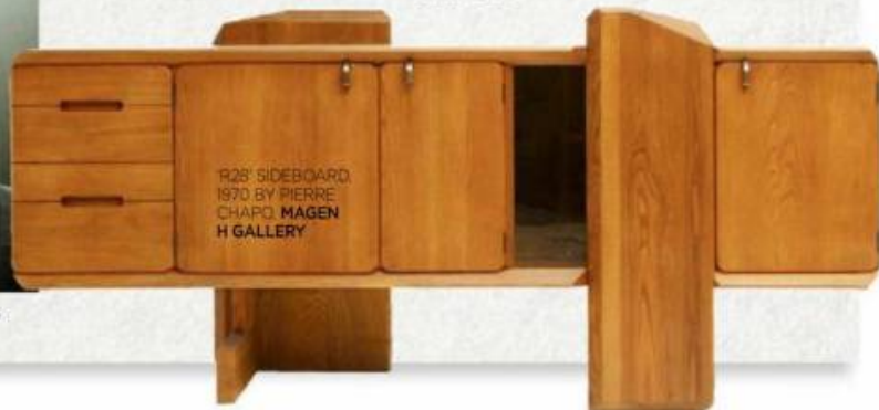
R28' SIDEBOARD 1970 BY PIERRE CHAPO, MAGEN H GALLERY