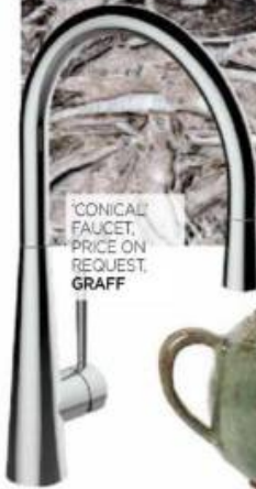
'CONICAL' FAUCET, PRICE ON REQUEST, GRAFF