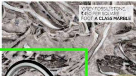
'GREY FOSSIL' STONE, ₹450 PER SQUARE FOOT. A CLASS MARBLE