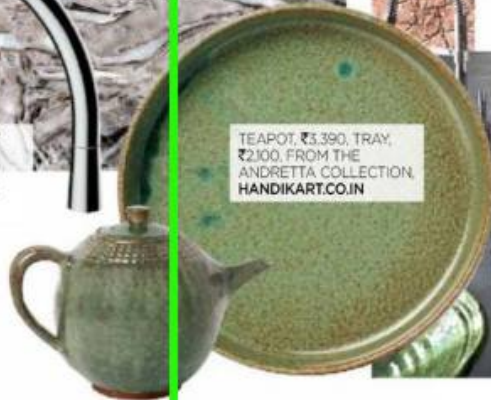
TEAPOT, ₹3,390, TRAY, ₹2,100, FROM THE ANDRETTA COLLECTION, HANDIKART.CO.IN