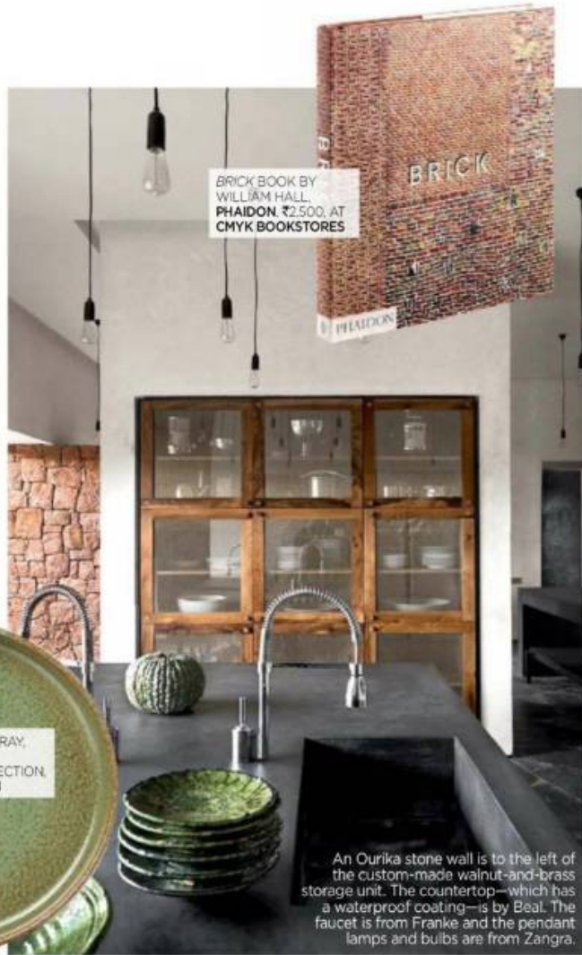
BRICK BOOK BY WILLIAM HALL, PHAIDON, ₹2,500, AT CMYK BOOKSTORES

An Ourika stone wall is to the left of the custom-made walnut-and-brass storage unit. The countertop—which has a waterproof coating—is by Beal. The faucet is from Franke and the pendant lamps and bulbs are from Zangra.