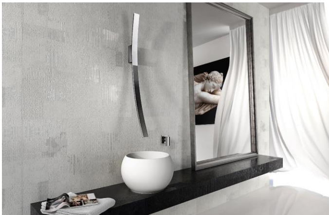
ENCLOSED PREVIEW IMAGES (Salone del Mobile 2018 Concept)